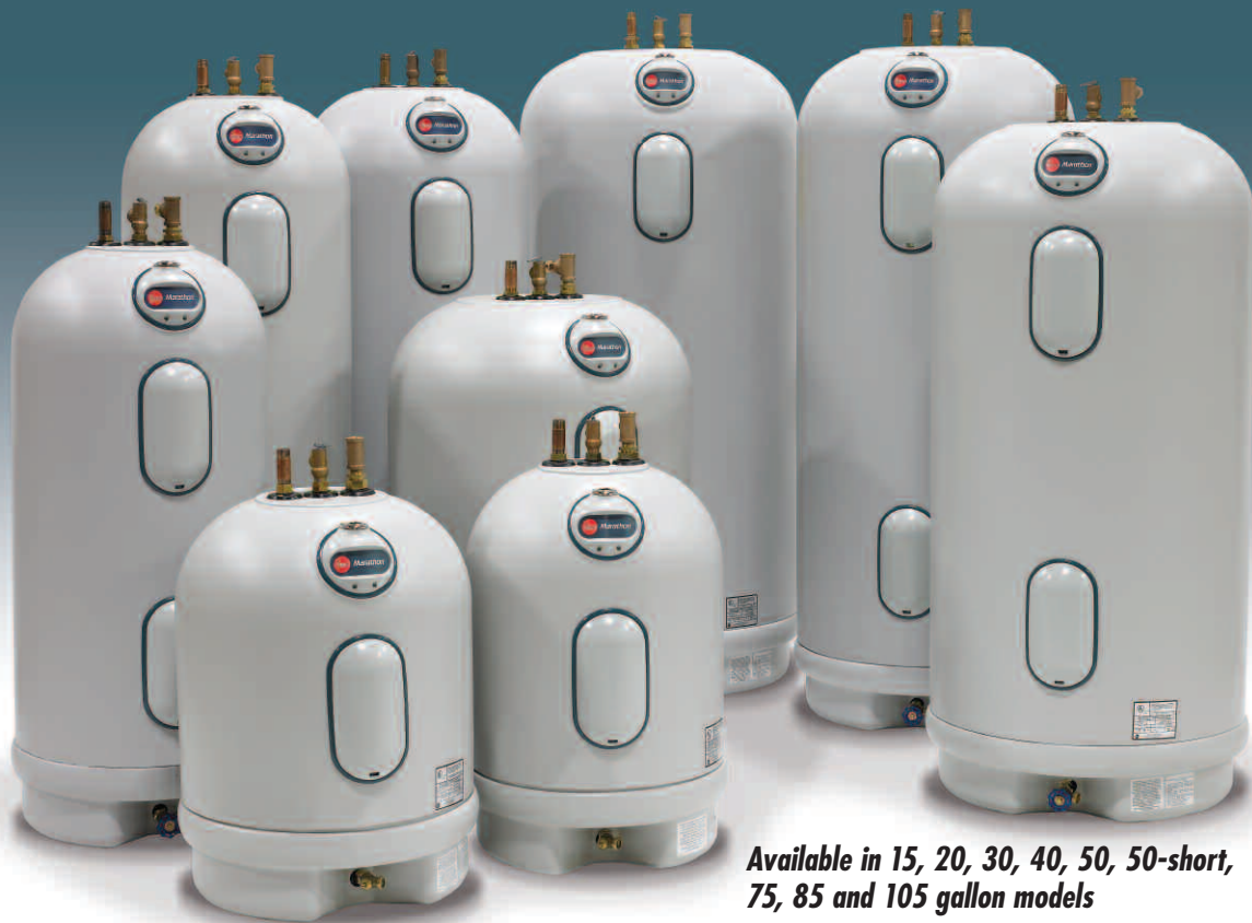
Available in 15, 20, 30, 40, 50, 50-short, 75, 85 and 105 gallon models